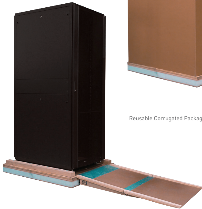
Reusable Corrugated Packaging Sleeve

The Rack & Stack packaging solution has been tested to ISTA 3B for a 3000 pound dynamic load capacity and is available with everything needed to ship a fully loaded cabinet.