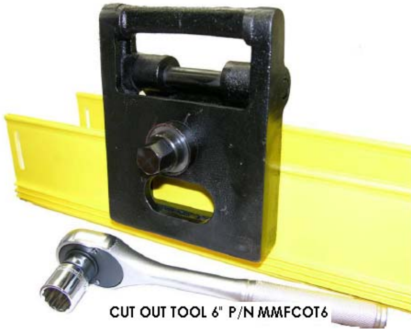
CUT OUT TOOL 6" P/N MMFCOT6