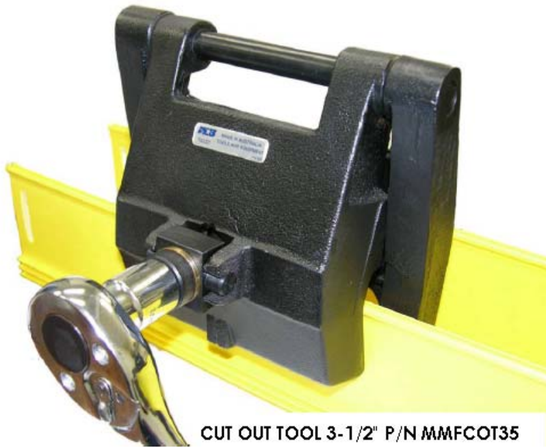
CUT OUT TOOL 3-1/2" P/N MMFCOT35