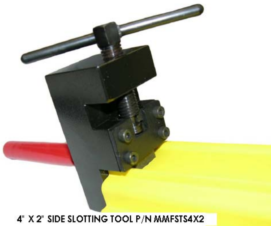
4" X 2" SIDE SLOTting TOOL P/N MMFSTS4X2