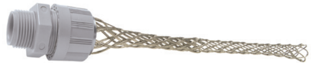
Nylon Cord Grip Straight Male with Stainless Steel Mesh