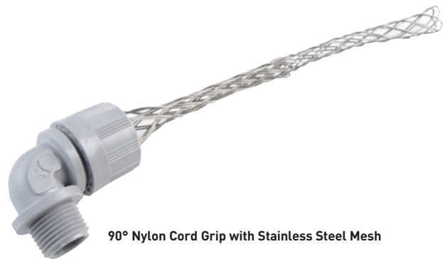
90° Nylon Cord Grip with Stainless Steel Mesh

Most Flexcor products have UL and/or CSA Approvals. Please contact factory for approval information. All devices listed on this page meet NEMA 3R standards.