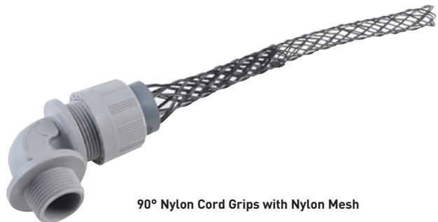
90° Nylon Cord Grips with Nylon Mesh