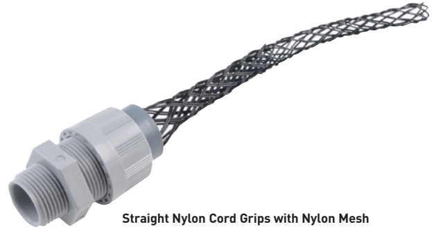
Straight Nylon Cord Grips with Nylon Mesh