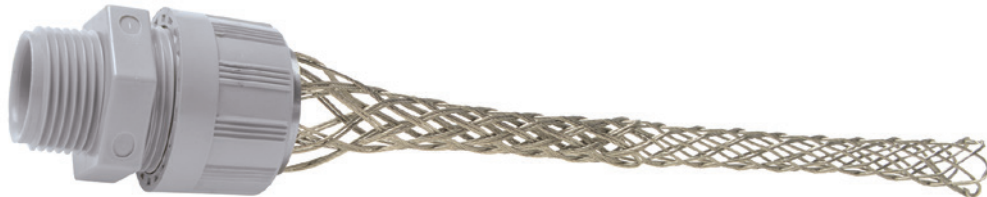
Nylon Cord Grip Straight Male with Stainless Steel Mesh