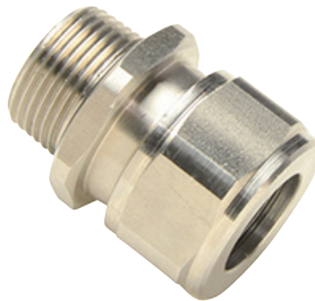
Stainless Steel Deluxe Cord Grip