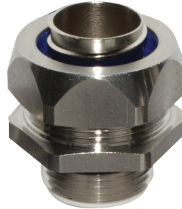
Stainless Steel Straight Liquid-Tight Fitting