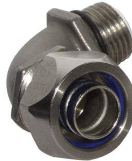
Stainless Steel 90° Liquid-Tight Fitting

Most Flexcor products have UL and/or CSA Approvals. Please contact factory for approval information.