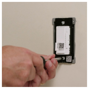
3) Install Smart Switch