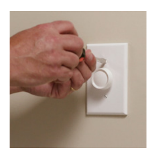
1) Turn off breaker