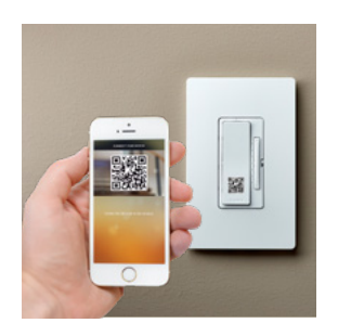
4) Connect to the App