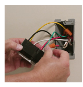
2) Remove existing switch