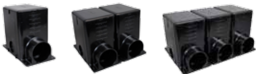
880MP2 box in a 1-gang, 2-gang and 3-gang configuration

GANGS TOGETHER TO PROVIDE MULTIPLE SERVICES.