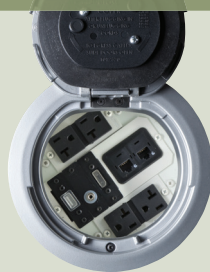
6AT Evolution Series

Recessed poke-thru device with 3-gangs of capacity for future expansion and configurability