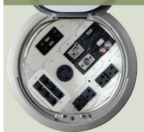
10AT Evolution Series

An industry first with 8-gangs of capacity