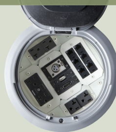
8AT Evolution Series

Large capacity dual service recessed poke-thru device with 5-gangs