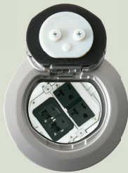
4AT Evolution Series

Perfectly sized with 2-gangs for smaller capacity needs