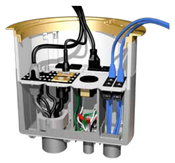
No Junction Box Required