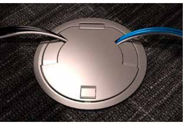
Innovative Cover Assembly