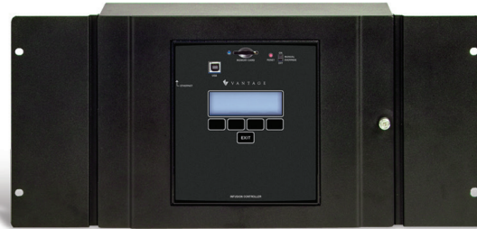
Houses 36V controller