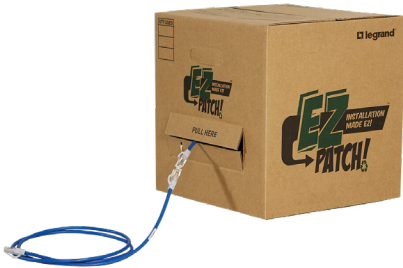
EZ Patch Boxes & Reduced Diameter Boxes, EZC6A05Q50-05