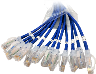
EZ Patch Clarity Flat Pack, EZFFPM609Q12-06

EZ Patch boxes, available in both Clarity and Reduced Diameter options, provide a “tissue box” like dispensing solution, eliminating tie wraps and cord memory; the cords dispense one after another, ready to install. The next generation of EZ Patch solutions, EZ Patch Flat Pack. This enhancement provides bulk packaged Clarity or Reduced Diameter patch cords straight and flat, offering a quick and convenient way to introduce new cabling to a data center or building network while enabling a cleaner, dust-free application when cardboard is prohibited in the data center. Together, EZ Patch solutions provide a better way to patch.