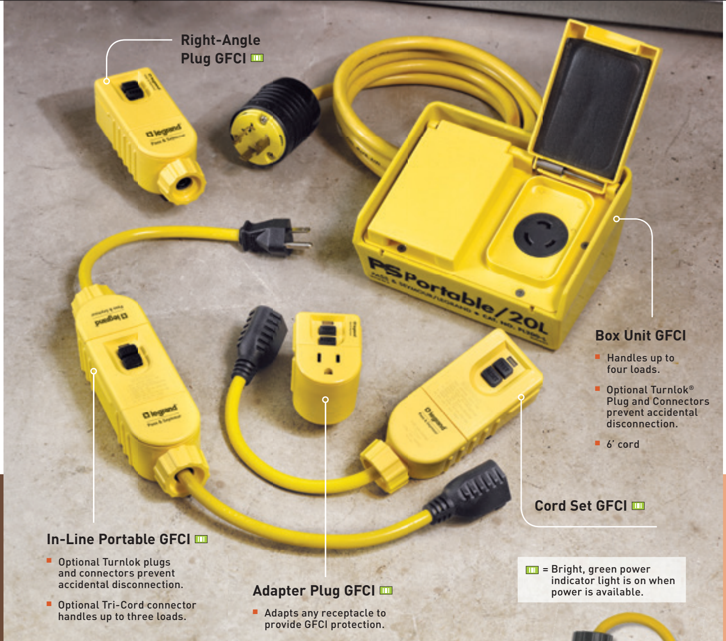
Right-Angle Plug GFCI