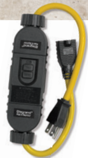
In-Line Portable Auto Reset GFCI